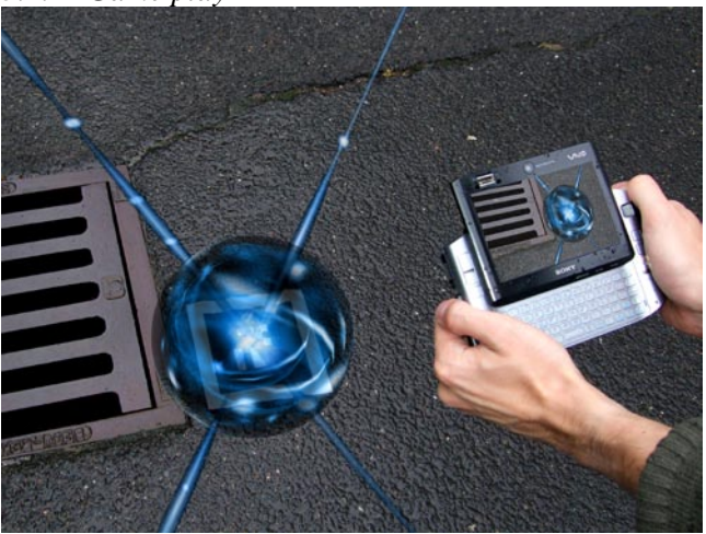
Figure 1: A player of Interference investigating a network node with his UMPC.

In the description of the game play we will focus on the Augmented Reality part and only briefly cover the other. In the game, a group of six players assume of the roles of telecommunication technicians. They are asked by their boss (played by an actor) to investigate strange breakdowns in the network. Wearing overalls and equipped with some gadgets, the players seek out to find these disturbances. The first one is easily found: a pulsating blue sphere serving as a node in the network. The players also recognize two energy lines going into different directions as seen in Fig. 1.. The players can now follow these