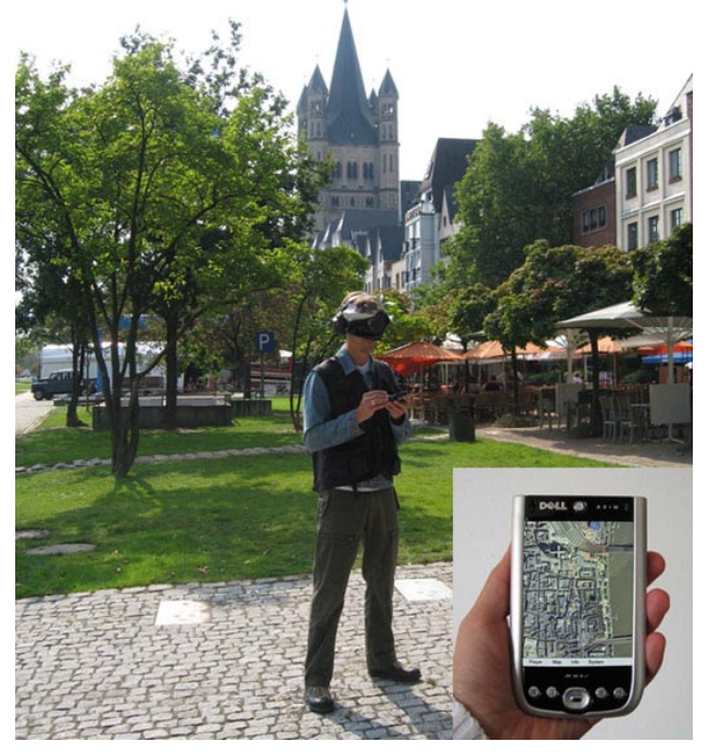
Figure 3 AR system and interactive map.

TimeWarp is based on the Interference game and on the MORGAN AR/VR Framework [18]. We implemented three core interaction controls. The first control uses physical proximity; here the system reacts to the player's physical proximity to an object or location. We distinguish between three distances: outside, near or directly at the game location. The second control is the focus-action-control. Focus is controlled by a view pointer, dveloped using an orientation sensor attached to the HMD. The action is triggered by pressing a mouse button. The third control is the placing control. Using a gyroscopic mouse moving in midair, an item can be placed. This interaction control was inspired by the Wii remote controller.