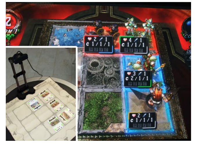
Figure 4. The Eye of Judgment : Playing mat with cards and PlayStation Eye (small) and the augmented view on the screen (big).

During the game, the screen displays the playing field which is enhanced by terrain in each square and other graphical effects. The real playing field is never seen on the screen as it is completely overlaid by virtual characters and objects as seen on Figure 4. Aside from monster and spell cards, there are also four function cards that can be used for events such as ending a turn or canceling a move. This way the complete game can be controlled via cards, there is no need for other interaction devices like a controller as soon as the game has started.